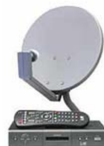
Satellite Dish, Decoder and remote

Since last month's article SKY and Freeview have announced that they will be broadcasting some channels in High Definition (HD) about mid year. You will need a special decoder, costing about $500 to get HD. None of the current TV's on the market have a decoder (HD TV Tuner) built in. but should have by year's end. There are numerous price reductions on current models as manufacturers get rid of existing stock. By about 2012 - 2014 the present analogue system will be shut off. After that you will need a digital tuner, either built-in or as a set-top box. Unless you need a new TV now or think you will use HD, hold off until the built-in units arrive.