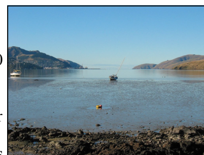
Lyttelton Harbour. Canon G2 4MP

Emailing photos is slow. Files are sized in Bytes. The word CALCULATOR is 10 Bytes. 100 words is 1000 Bytes or 1 Kilobyte. A simple novel is about 1,000,000 Bytes or 1 Megabyte. A 4 megapixel camera photo is about 2 Megabytes. Sending time depends on your internet speed. Internet speeds are measured in Bits per Second. Dial-up 56 Kb/s will take 5 mins. 1Mbs Broadband - 16 secs. Sending 30 photos takes 2.5 hours and 5 minutes respectively. Also consider