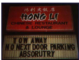
Chinese Spell Checker